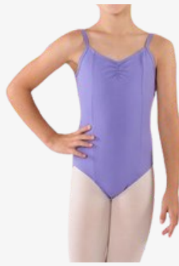
GRADE 2 'JACARANDA' ENERGETIKS OPHELIA LEOTARD