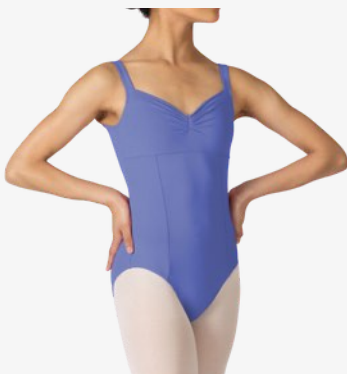
GRADE 4 'ZAFFIRO' BLOCH ONDINA LEOTARD