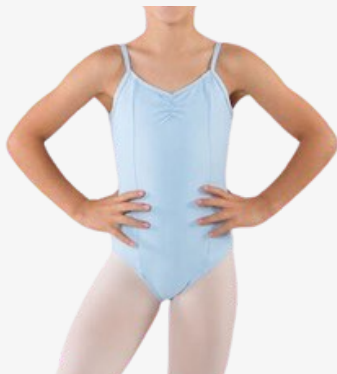
GRADE 1 'BABY BLUE' ENERGETIKS OPHELIA LEOTARD

GRADE 1 TO INTERMEDIATE - SPECIFIC BRAND ONLY