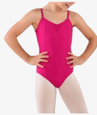
GRADE 3 'MULBERRY' ENERGETIKS OPHELIA LEOTARD