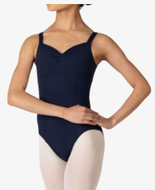
INTERMEDIATE 'NAVY' BLOCH ONDINA LEOTARD