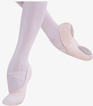
RÉVÉLATION CANVAS BALLET SHOE - TECH FIT COLOUR: THEATRICAL PINK