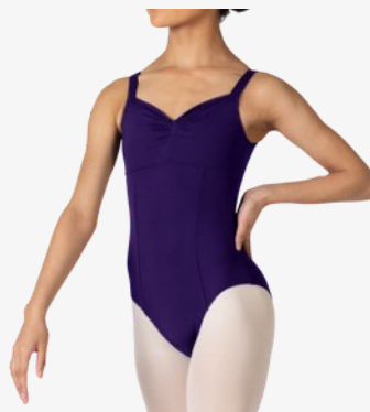
INTERMEDIATE FOUNDATION 'PURPLE IRIS' BLOCH ONDINA LEOTARD